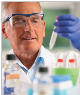
Pharmaceutical and chemical industry