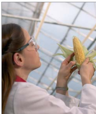
Food, feed and beverage industry

Cosmetics - creams, lotions, balm and oils.